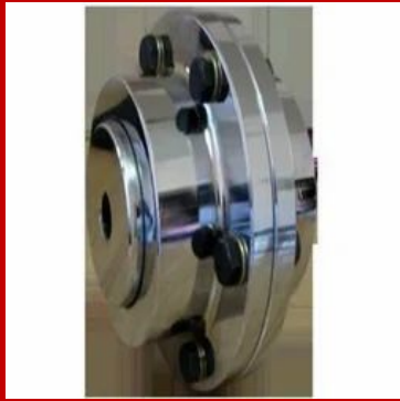
Full Gear Coupling