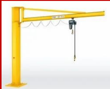
Pillar Type JIB Crane