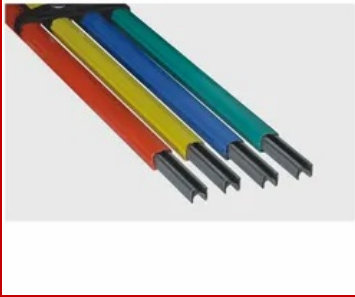
DSL Bus Bar System