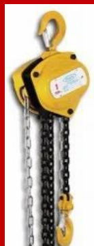
Kepro Chain Pulley Block