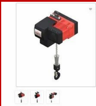
Electric Chain Hoist