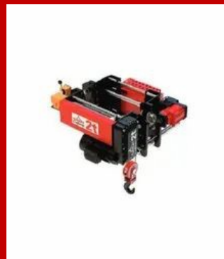
Electric Wire Rope Hoists