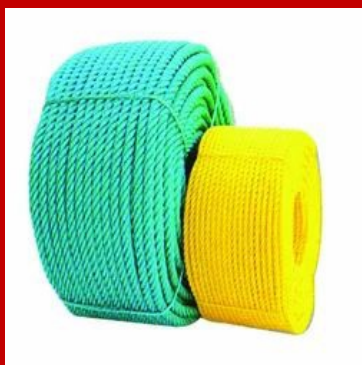
Garware Pp Rope