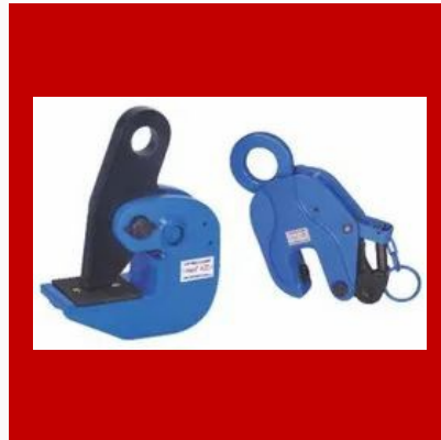
PLATE LIFTING CLAMPS