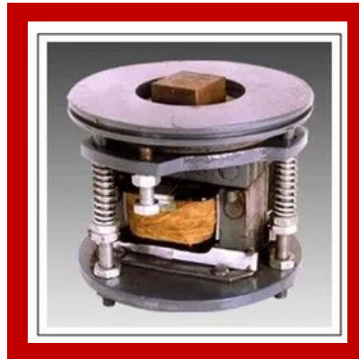
Electromagnetic Brake - DAT