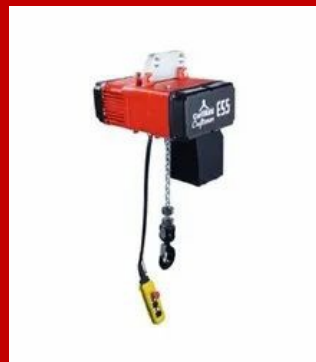
Electric Chain Hoist