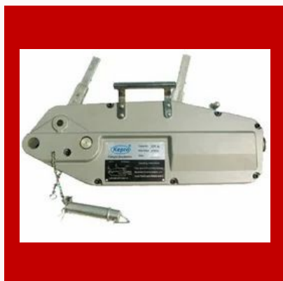
Pulling And Lifting Machine