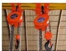
Morris Chain Pulley Block