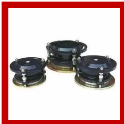
AC Brake Type T-Series