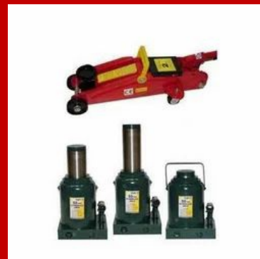
Hydraulic Bottle Jacks