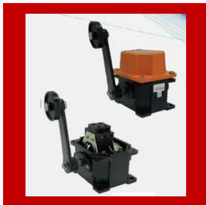
Lever Type Switch