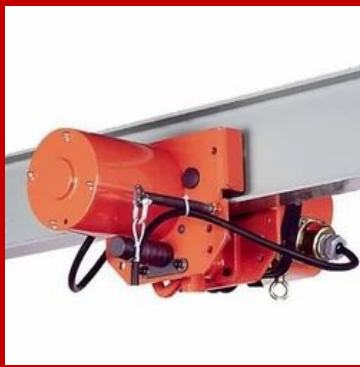
Motorized Transfer Trolley