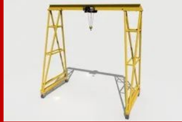
Portable Gantry Cranes