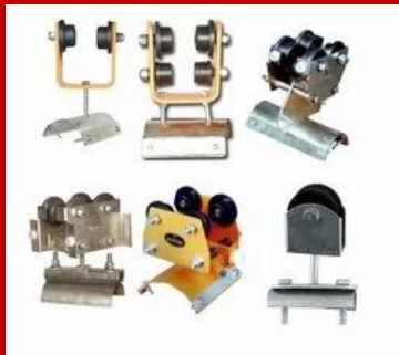
Electrical Crane Cable Trolley I Bim