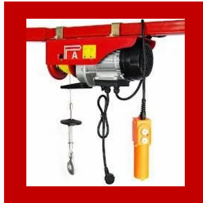
Mini Electric Hoist