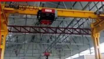
Single Girder EOT Crane