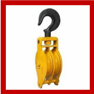
Heavy Duty Pulley