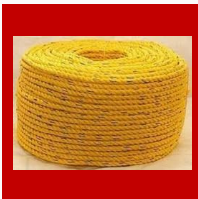
Yellow Poly Propylene Garware Ropes