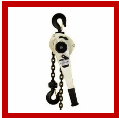
Ratchet Lever Hoist