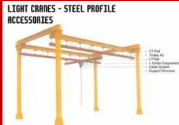
Light Crane System