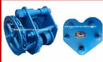
Geared Traveling Trolley