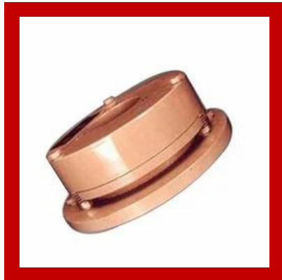
Electromagnetic Brake - SLDC