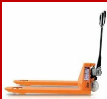
Hydraulic Pallet Truck