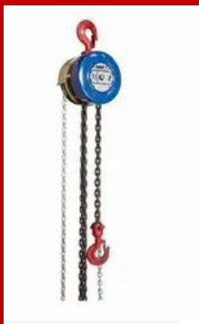
Indef Chain Pulley Block