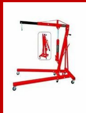
Hydraulic Jib Crane