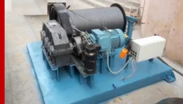
Electric Power Winch