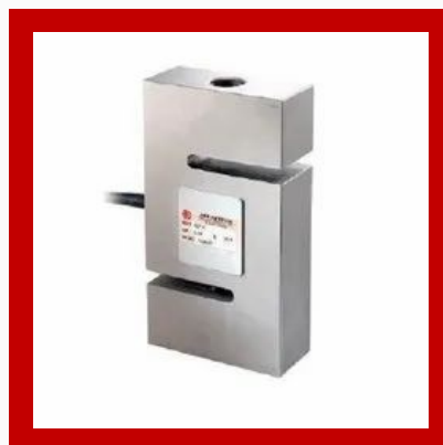
S-Type Load Cell