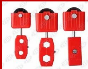
Electrical Crane Cable Carrier Plastic Trolley Steel Wire