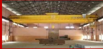
Double Girder EOT Cranes