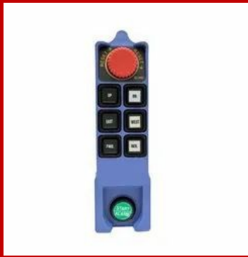
Radio Remote Control System