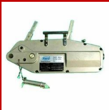
Pulling & Lifting Machine