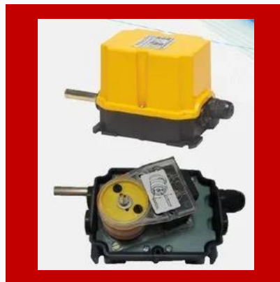
Rotary Limit Switches