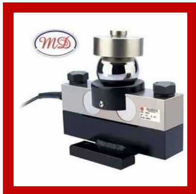
Weighbridge Load Cells