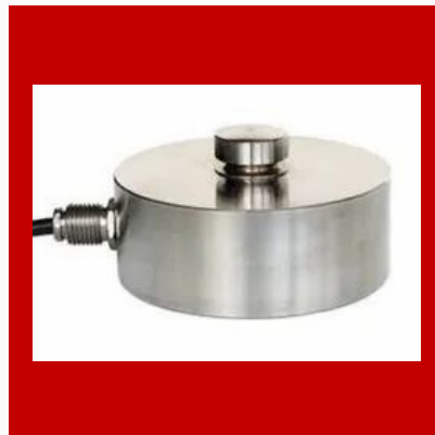
Button load cell