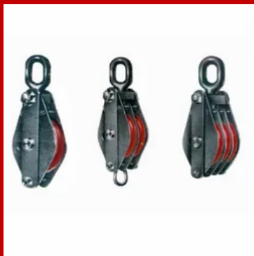
Wire Rope Pulley